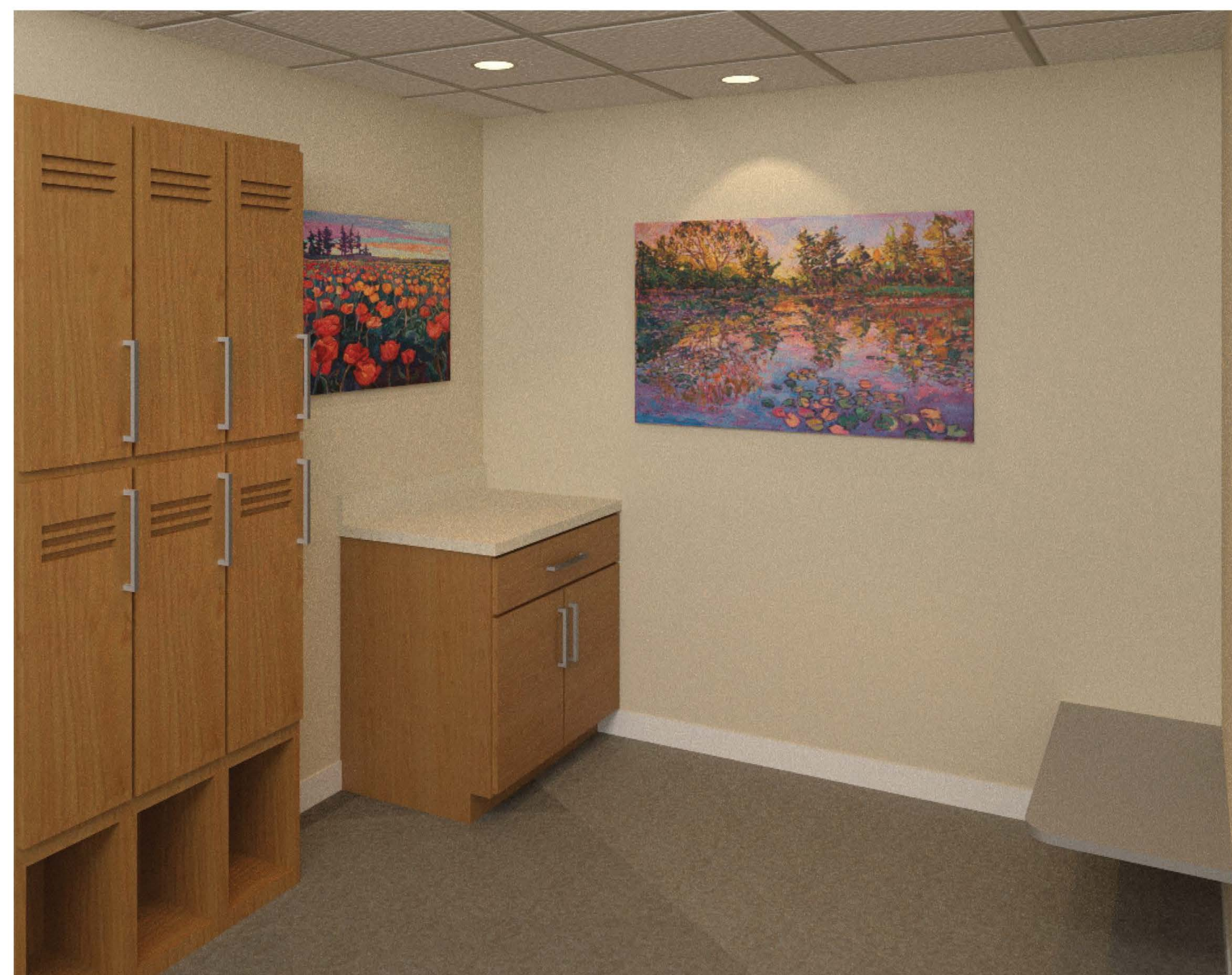
New patient changing room with private lockers.