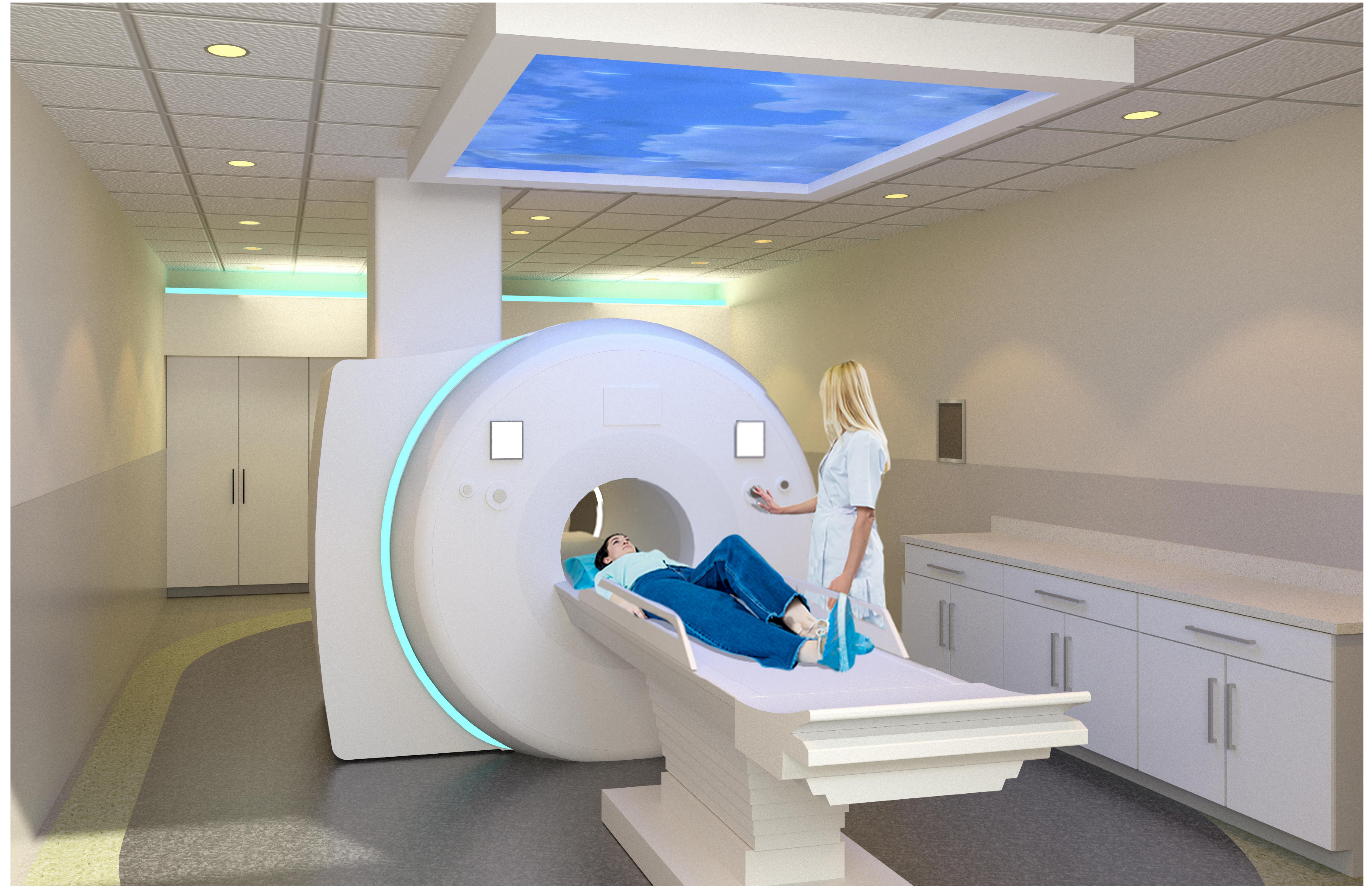
New Sieman's 1.5T Magnetom Sola MRI with wide-bore for more space and greater patient comfort. The new unit will bring increased services such as breast MRI, female pelvic scans, musculoskeletal imaging and small intestine (enterography) imaging.